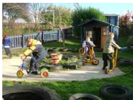
Play in the foundation area