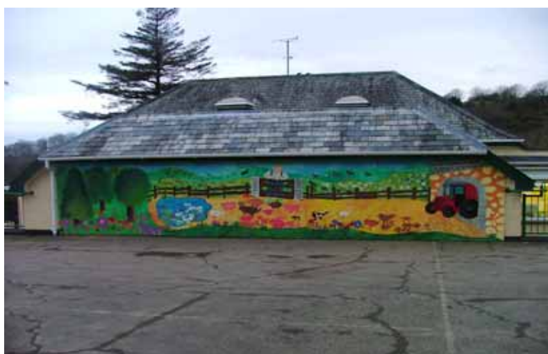
New Old McDonald had a farm mural

As well as the normal curriculum the school offers 'occasional' opportunity days, which introduce children to a variety of musical, art theatrical and environmental projects. For example, an African drum workshop, a residential art course, an Internet day and the building of the willow dome.