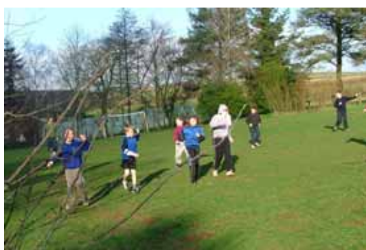
Football session on playing field