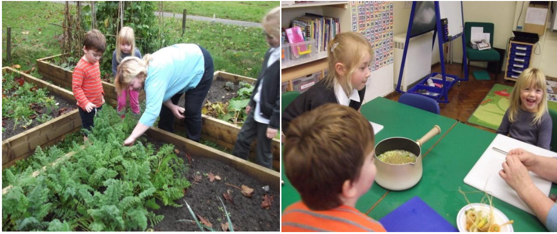
Your Little Berries Team